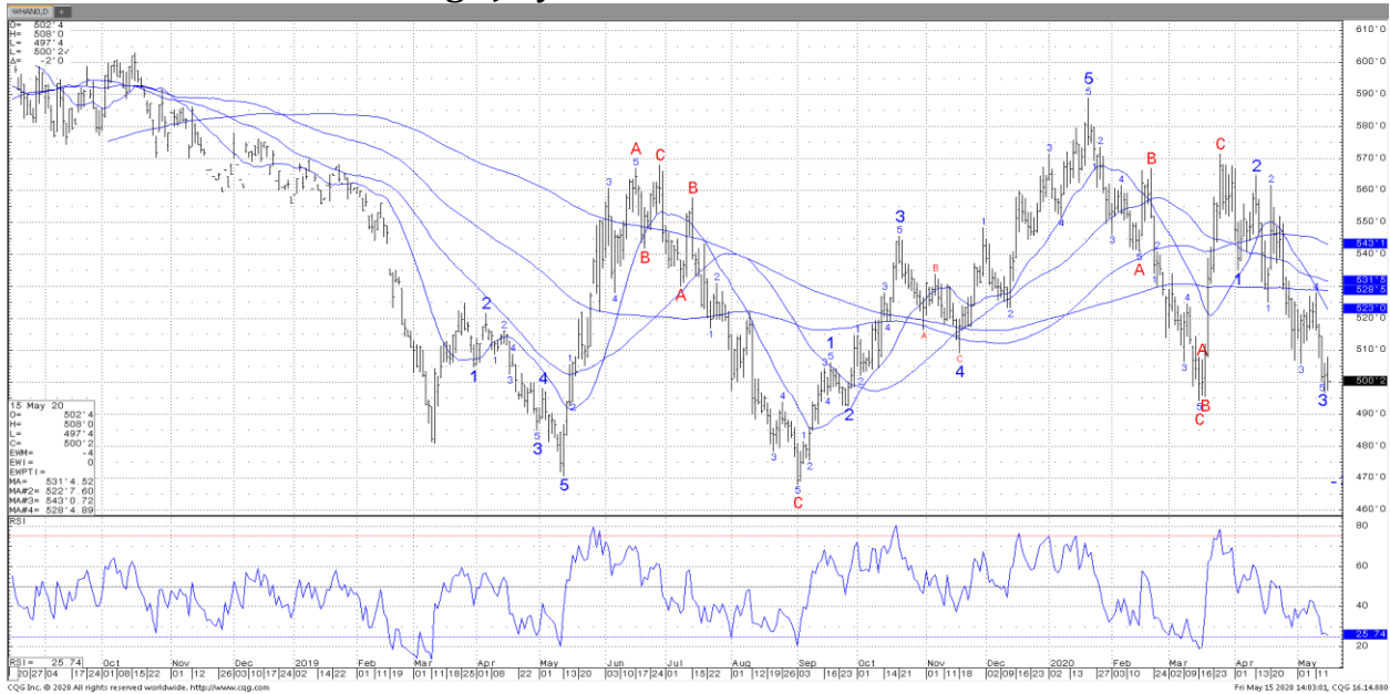
Chicago July wheat futures chart

Wheat futures traded mixed. Talk of one 3,000 contract order to sell Chicago July wheat dropped that market off its highs. Early talk of France estimating their wheat crop down from last week supported higher EU wheat futures. Some forecast of a drier Europe and Black Sea forecast offered support. Some feel uncertain weather in Europe and Black Sea could offer support near 4.75 WN. USDA estimate of record World 2020/21 wheat production and end stocks could limit the upside in prices without a weather problem. This week, USDA estimated US 2020 wheat crop near 1,866 mil bu versus 1,920 last year. Food use is estimated near 964 mil bu versus 962 last year. Feed use is estimated near 100 mil bu versus 135 last year. Globally steep drop in corn prices could reduce wheat feeding. USDA est US exports near 950 mil bu versus 970 last year. This leaves a carryout near 909 versus 978 last year. US estimate of US 2020 HRW crop is 740 mil bu versus 833 last year. SRW crop is estimated near 300 versus 239 last year. Crop observation in KY this week suggested yields higher than average.